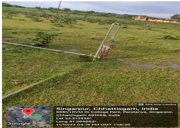
Pic :- Open borewell system/facility of institute

For the water source of our institution has open bore well system this bore well system provides water for daily use.